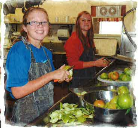
Sisters helping make apple crisp