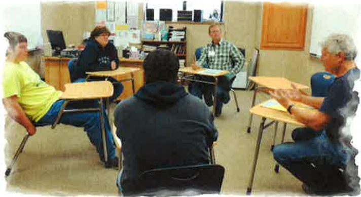
One of the treasured 3-staff men per family session